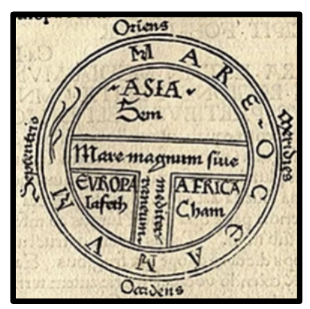
Figure 1 | From Guntherus Ziner, Augusta, 1472: picture from Etymologiae by Isidore of Seville (chapter 14, page 1).

The themes that we are going to discuss have been the object of my studies over the years, and to them I have dedicated part of my production. This necessary premise justifies the bibliography that might seem to be self-referential or expressing an unrealistic self-display intent, but whose entries on the contrary show a wide-ranging and documented collection of bibliographical references which provide useful information to explore every single theme.<sup>3</sup>